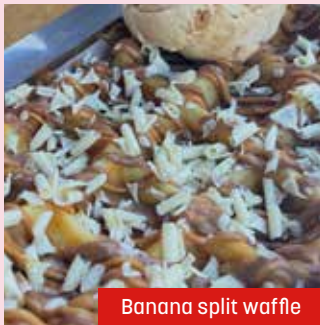
Banana split waffle