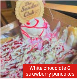
White chocolate & strawberry pancakes