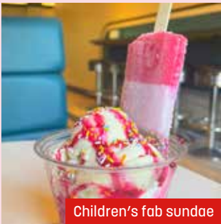
Children's fab sundae