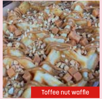
Toffee nut waffle