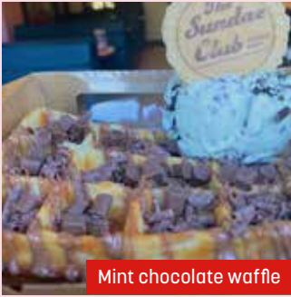
Mint chocolate waffle