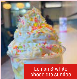
Lemon & white chocolate sundae