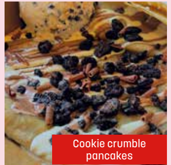
Cookie crumble pancakes