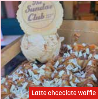
Latte chocolate waffle